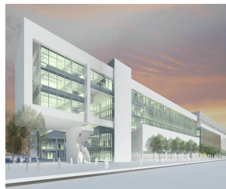
Architectural rendering of AHC5

tute, and the Department of Earth and Environment—the latter two from the College of Arts and Sciences. AHC 5 will also contain state of the art research space, including food science and behavioral labs, as well as classrooms, conference rooms and faculty offices.